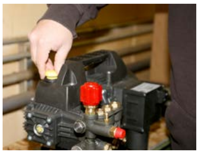
2. Replace with yellow vented oil cap found in accessory bag.