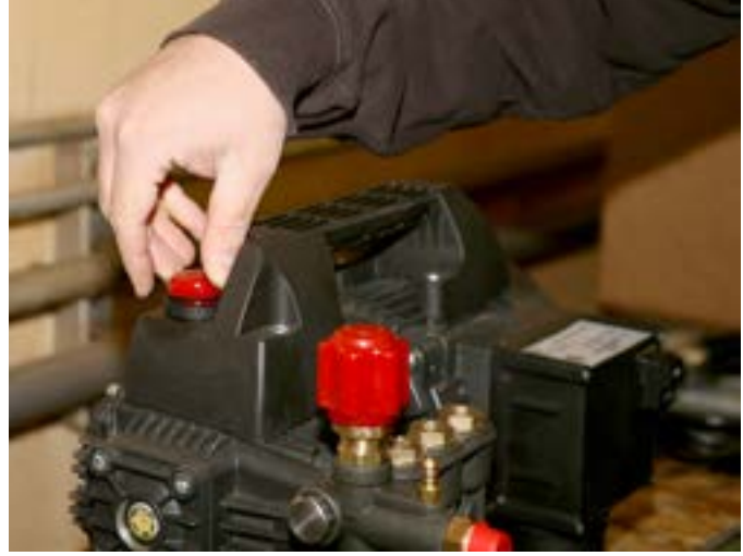
1. Remove red unvented oil cap as shown.